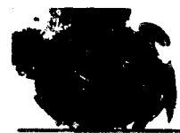
Pai Thai Chicken