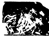
Seafood Yaki Udon