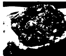
Pineapple Fried Rice