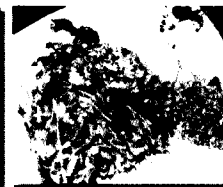
Chicken Phai Thai